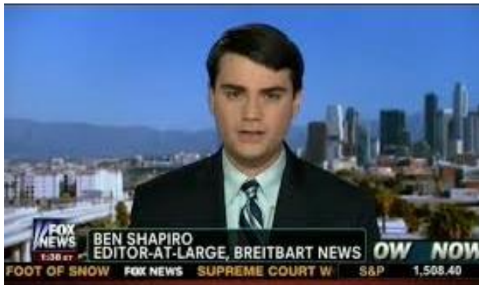
AUTHOR & NATIONALLY SYNDICATED COMMENTATOR BEN SHAPIRO APPEARED AT A COLAB ANNUAL DINNER