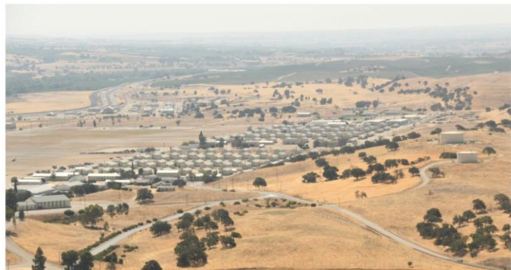
View of Camp Roberts.