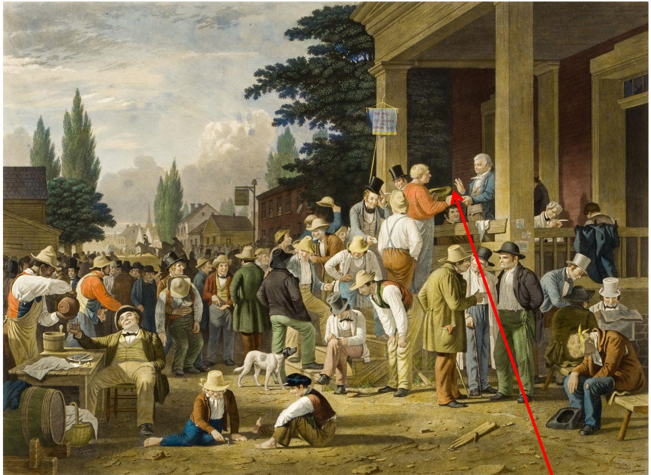
“The County Election” by George Caleb Bingham, 1854