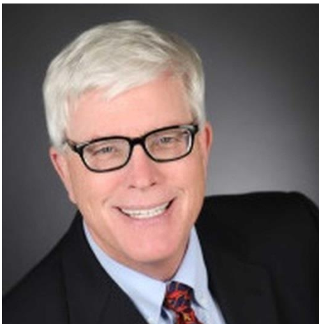
NATIONAL RADIO AND TV COMMENTATOR HIGH HEWITT AT COLAB DINNER