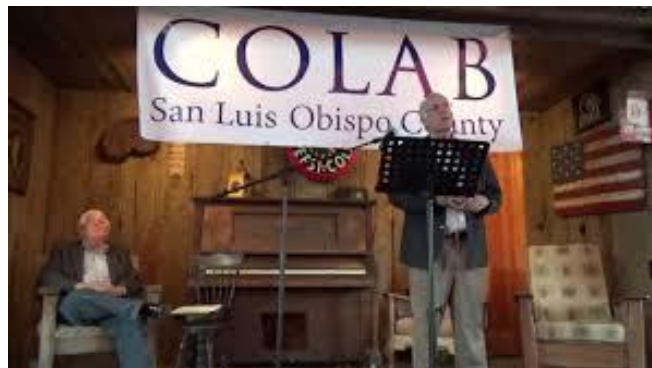
VICTOR DAVIS HANSON ADDRESSES A COLAB FORUM